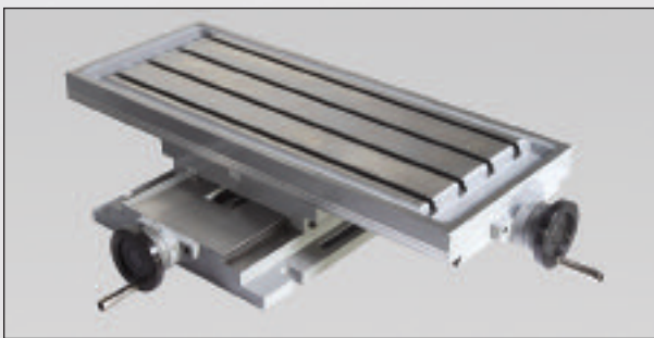
Optional MB-5D 18.5" x 11.5" cross slide table